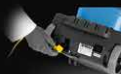
The power cable is easy to replace