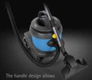
The handle design allows to hold the suction tube

The telescopic tube made of steel is robust and height-adjustable: it guarantees a comfortable use avoiding back straining and it optimizes the use of the other accessories