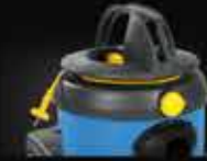
FA15+ helps to make cleaning easier thanks to the foot switch, the handle with cable winder and the accessory holder